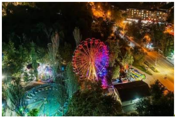
Location: Str. Valea Trandafirilor