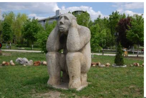
Location: Str. Studenților 9, Universitatea Tehnica din Chisinau