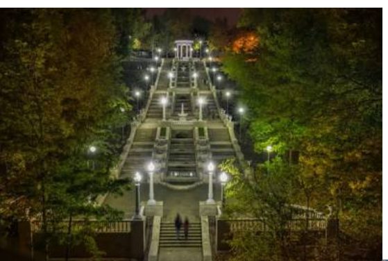
Location: Str. Grigore Alexandrescu, Valea Morilor