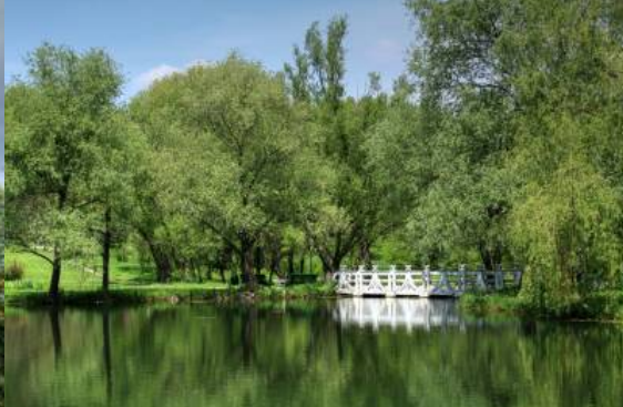
Location: Str. Pădurii 18, Gradina Botanica