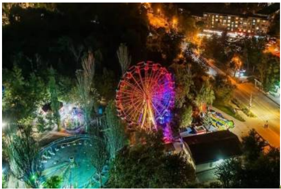
Location: Str. Valea Trandafirilor