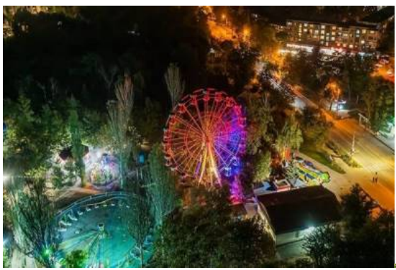
Location: Str. Valea Trandafirilor