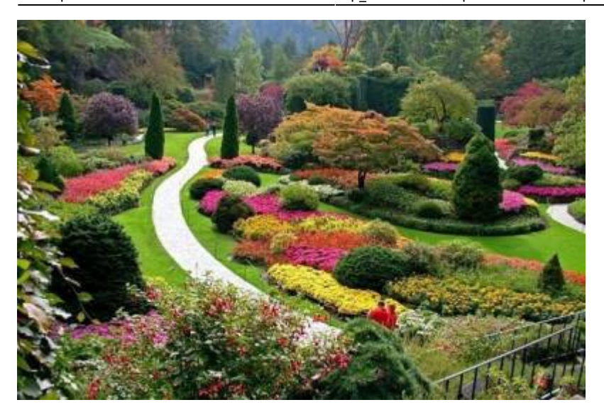
Location: Street Ion Creangă 1, Dendrarium