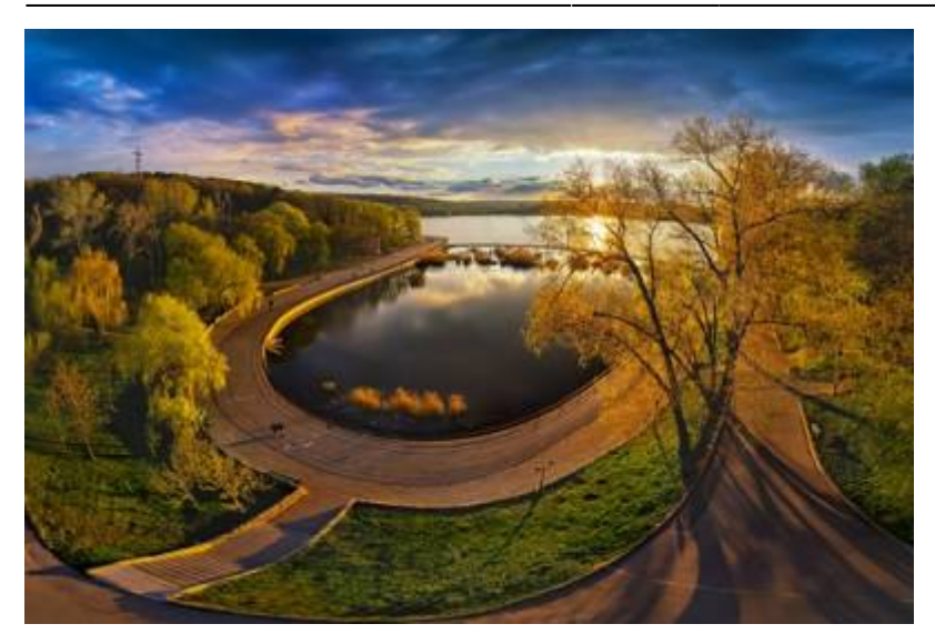
Location: Str. Grigore Alexandrescu, Valea Morilor

2025/07/14 08:06 5/11 Top Attractions in Chișinău