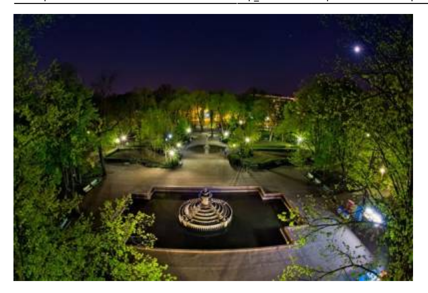
Location: Boulevard Ștefan cel Mare și Sfînt