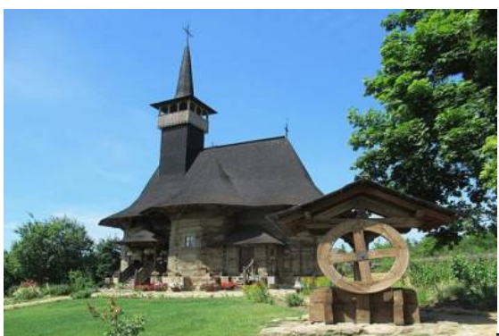
Location: Str. Aeroportului, Muzeul Satului