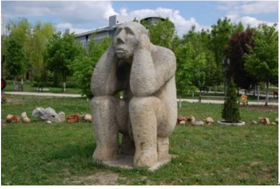
Location: Str. Studenților 9, Universitatea Tehnica din Chisinau