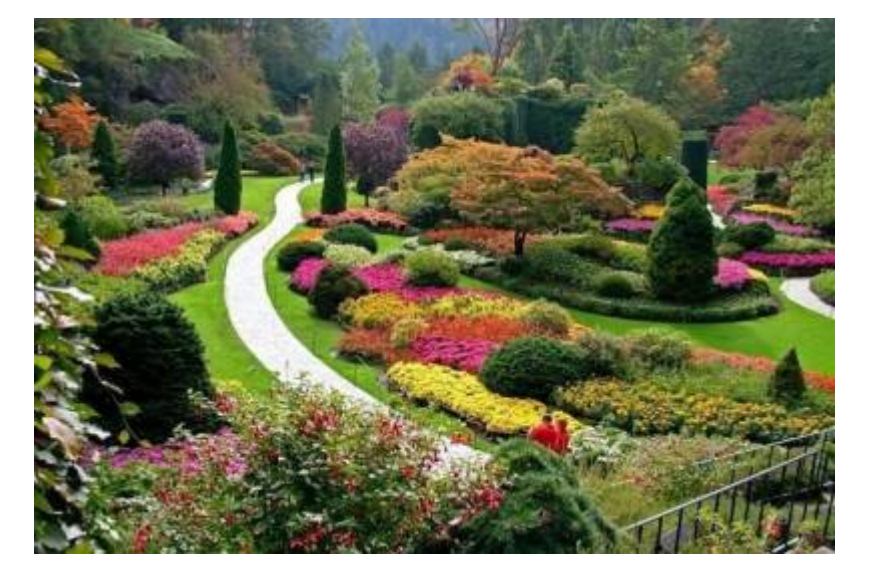
Location: Street Ion Creangă 1, Dendrarium