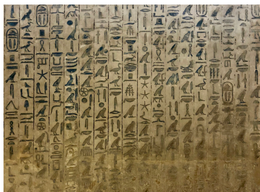
Unas' Pyramid Texts

The Pyramid of Unas at Saqqara contains the oldest version of the Pyramid Texts, dated to 2353-2323 BC.