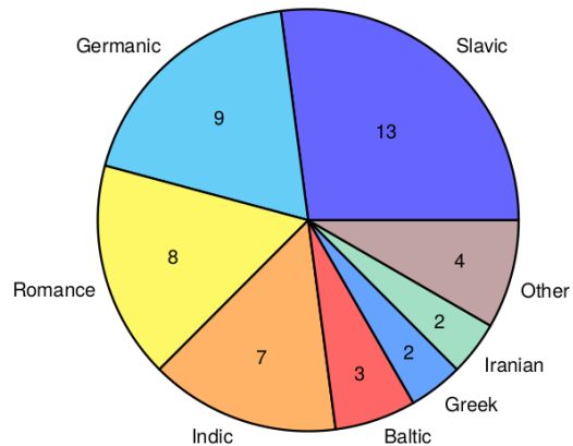
Figure 2: Number of languages in PLHD per Indo-European genus. Other comprises Celtic, Italic, Albanian, and Armenian.

...tice, obviously, the work is done by people who enter one or more WGs; this community speaks for